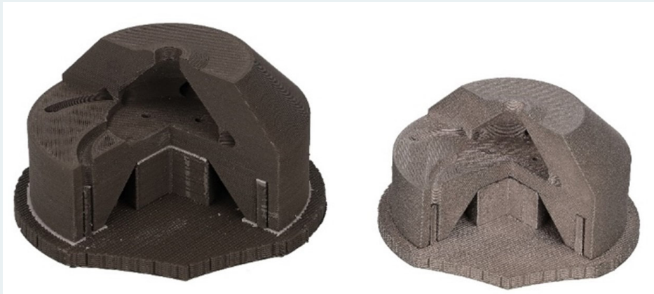
Figure 1 Green part with support structures and Ultrafuse Support Layer and sintered part with support structure