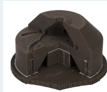
Figure 3 Green part with support structures

After debinding structural stability of the parts is at its minimum. Smart part orientation and the use of support structures in printing, reduces significantly the risk of failure in debinding and sintering. It is recommended to print the parts as flat as possible with sufficient amount of supports Please see in Picture x below an example for required supports.